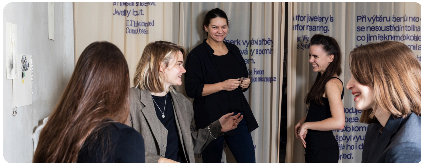
The City (Superstudio + Openstudio)