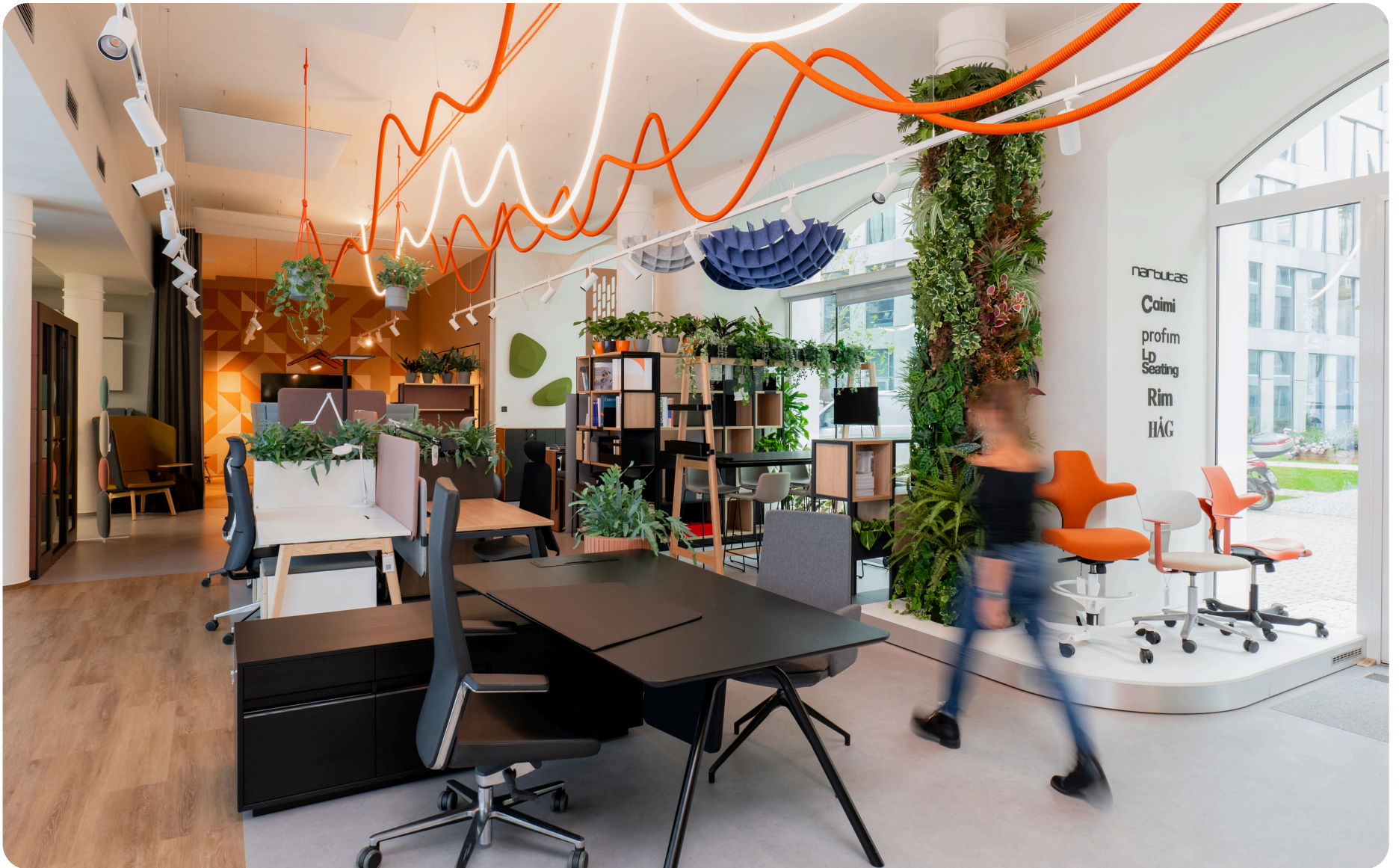
The City (Superstudio + Openstudio)