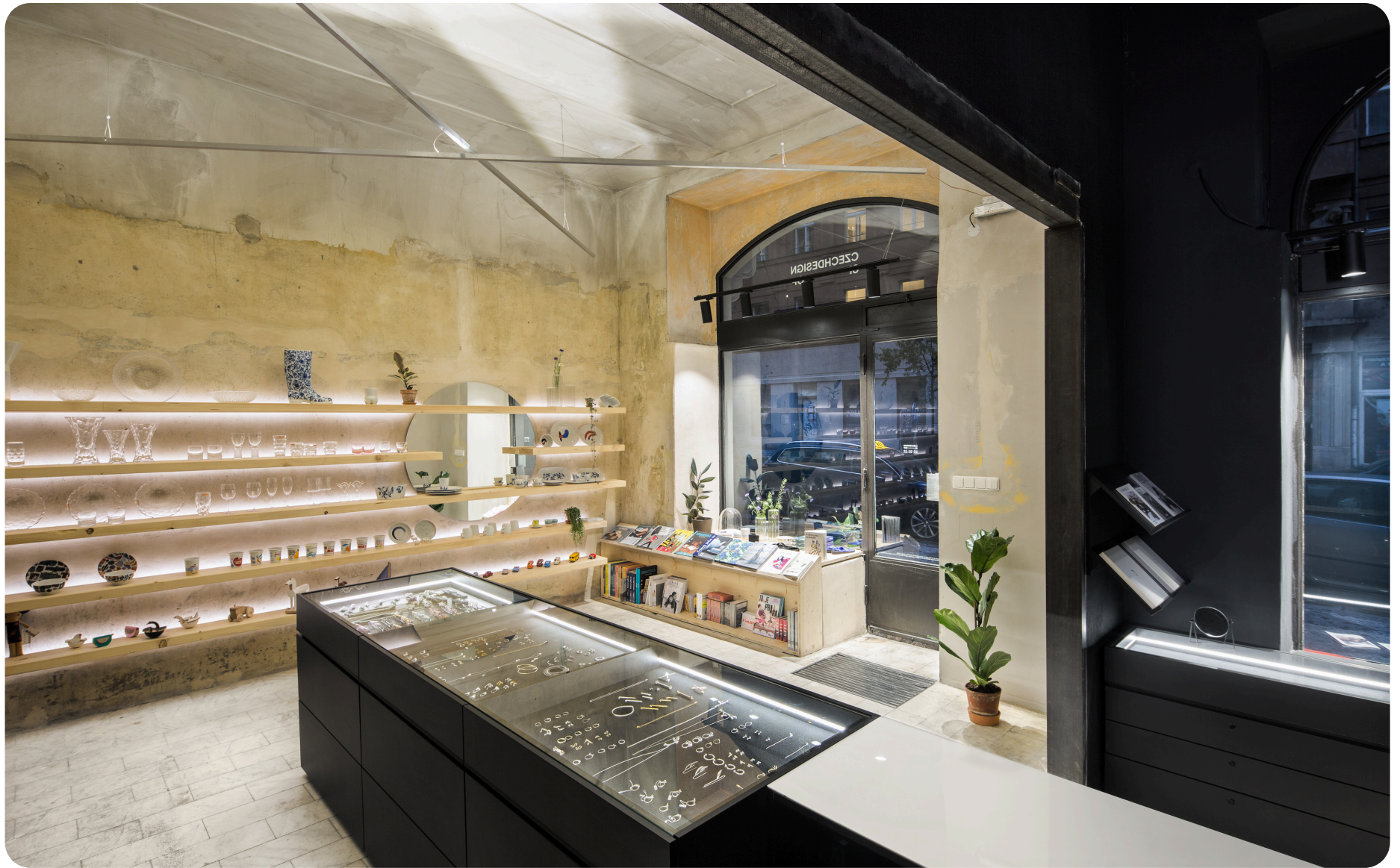
The City (Superstudio + Openstudio)