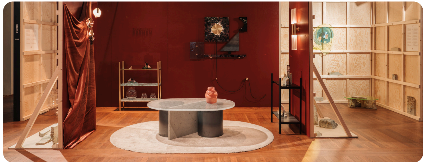
Openstudio — Museum of Decorative Arts in Prague