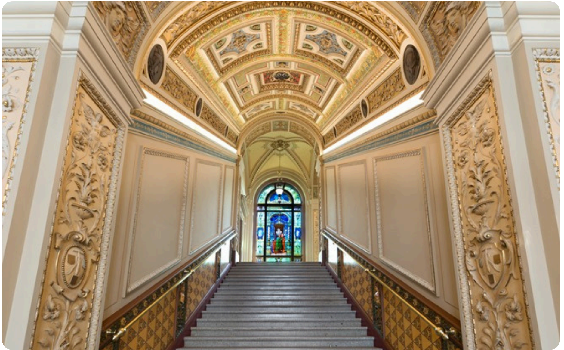
Openstudio — Museum of Decorative Arts in Prague