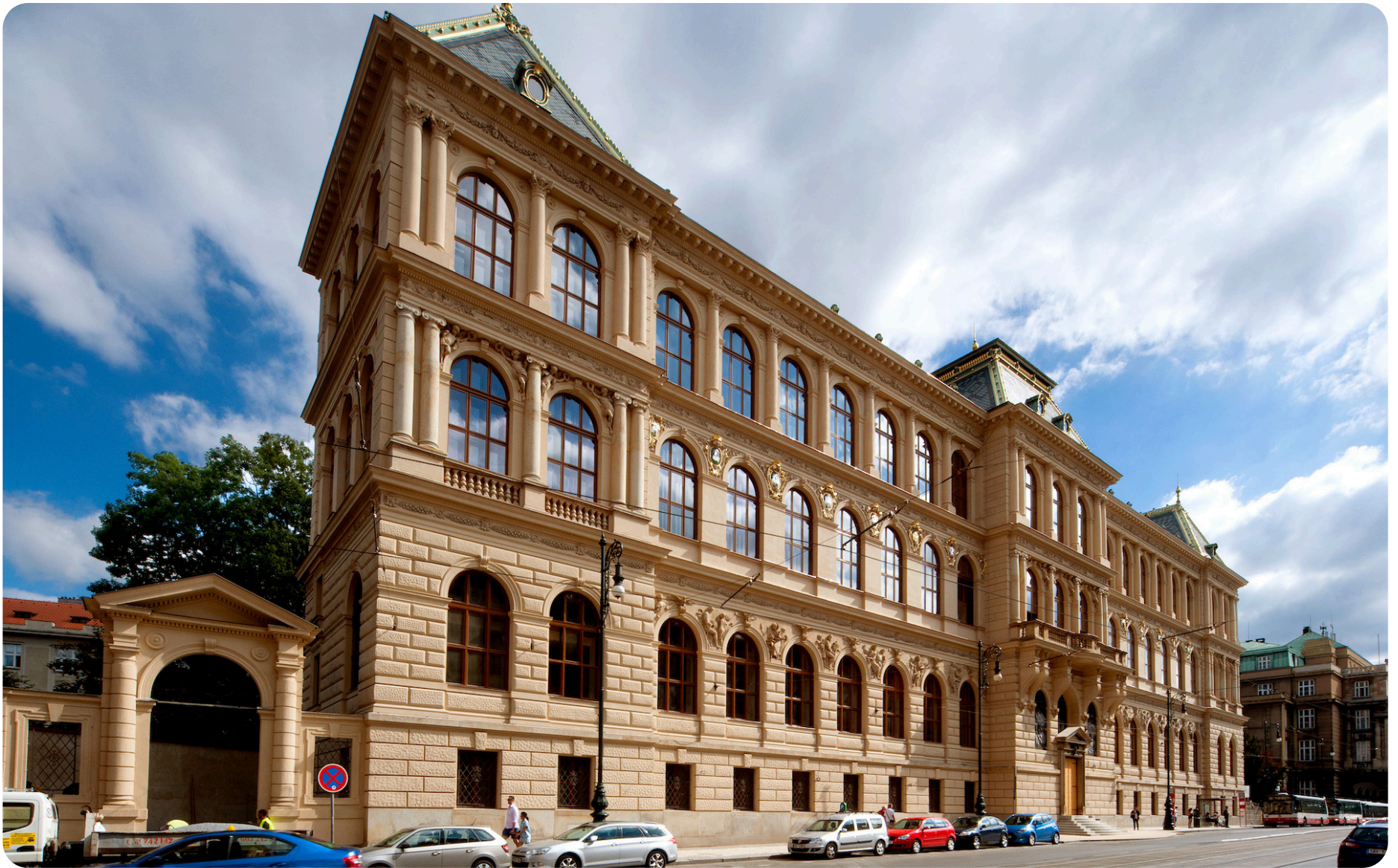
Openstudio — Museum of Decorative Arts in Prague