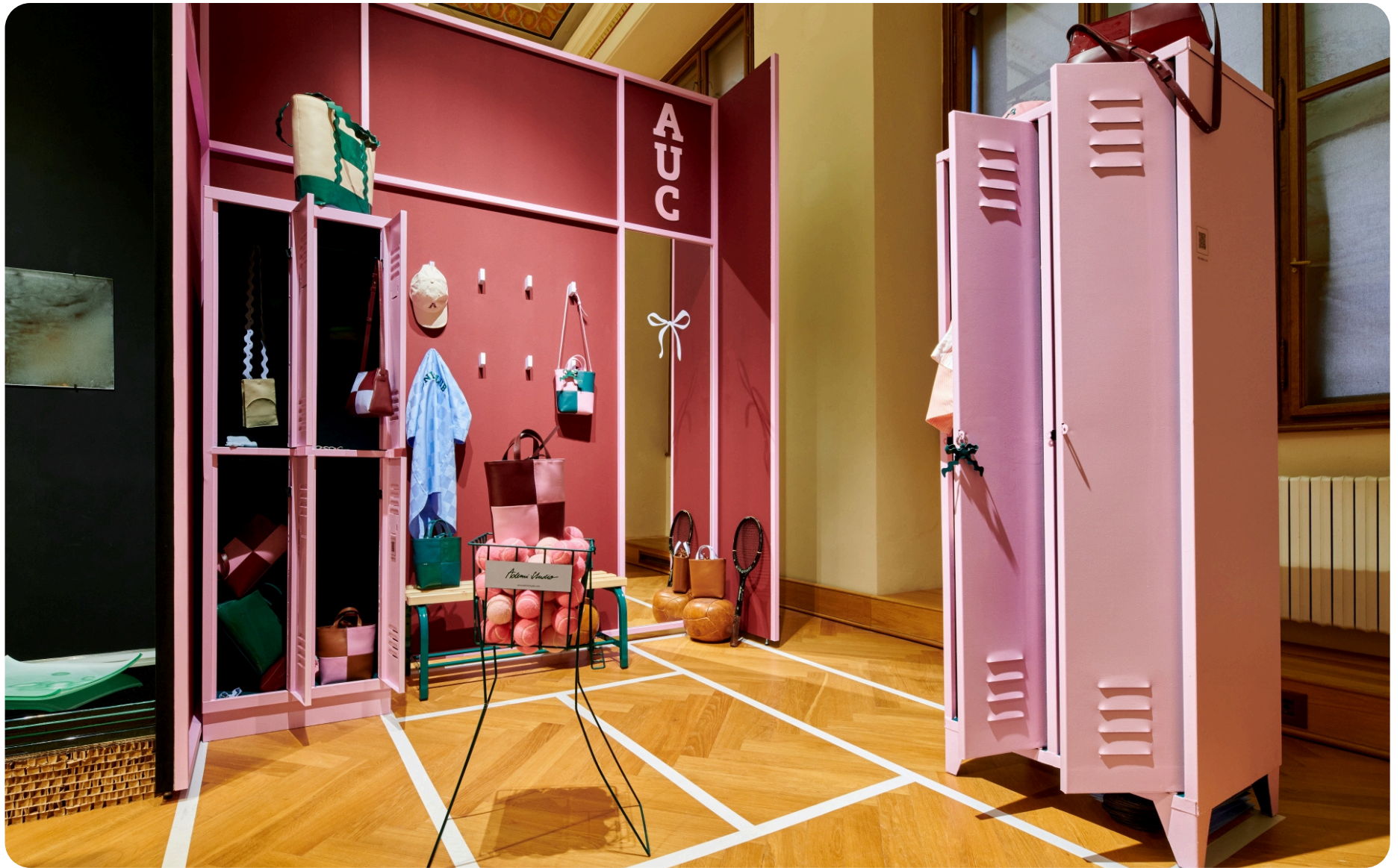
Openstudio — Museum of Decorative Arts in Prague