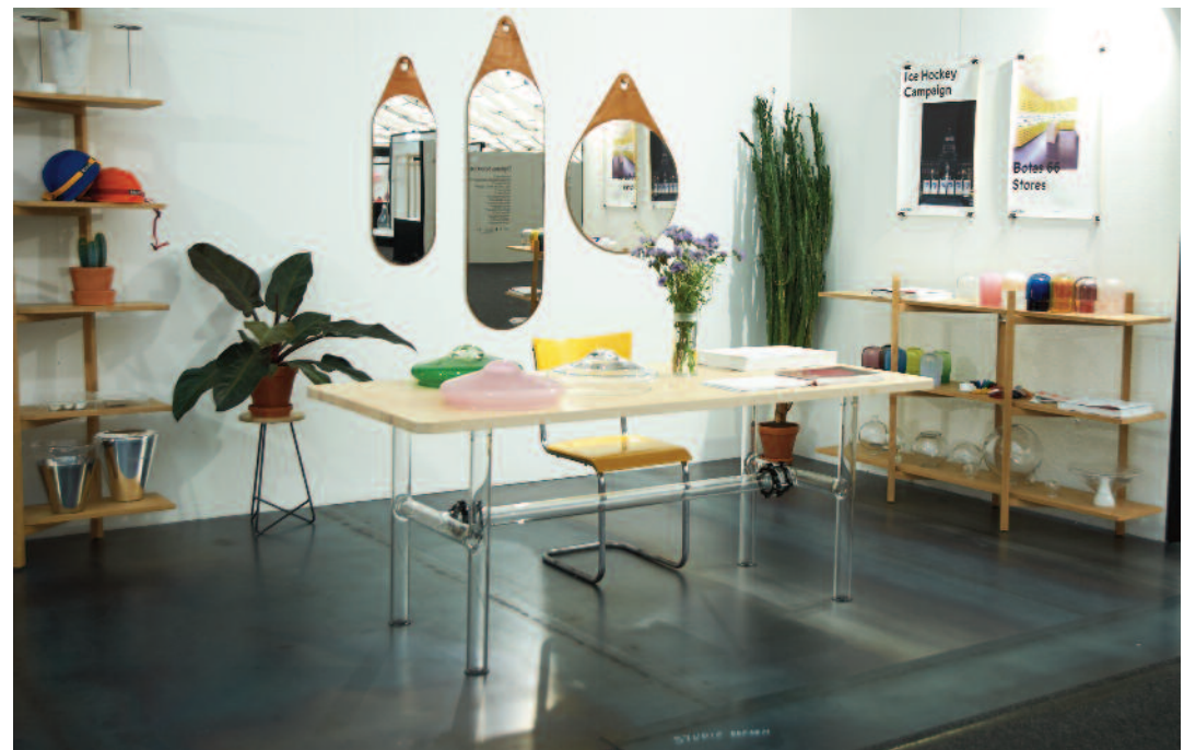
deFORM, Designblok 2017