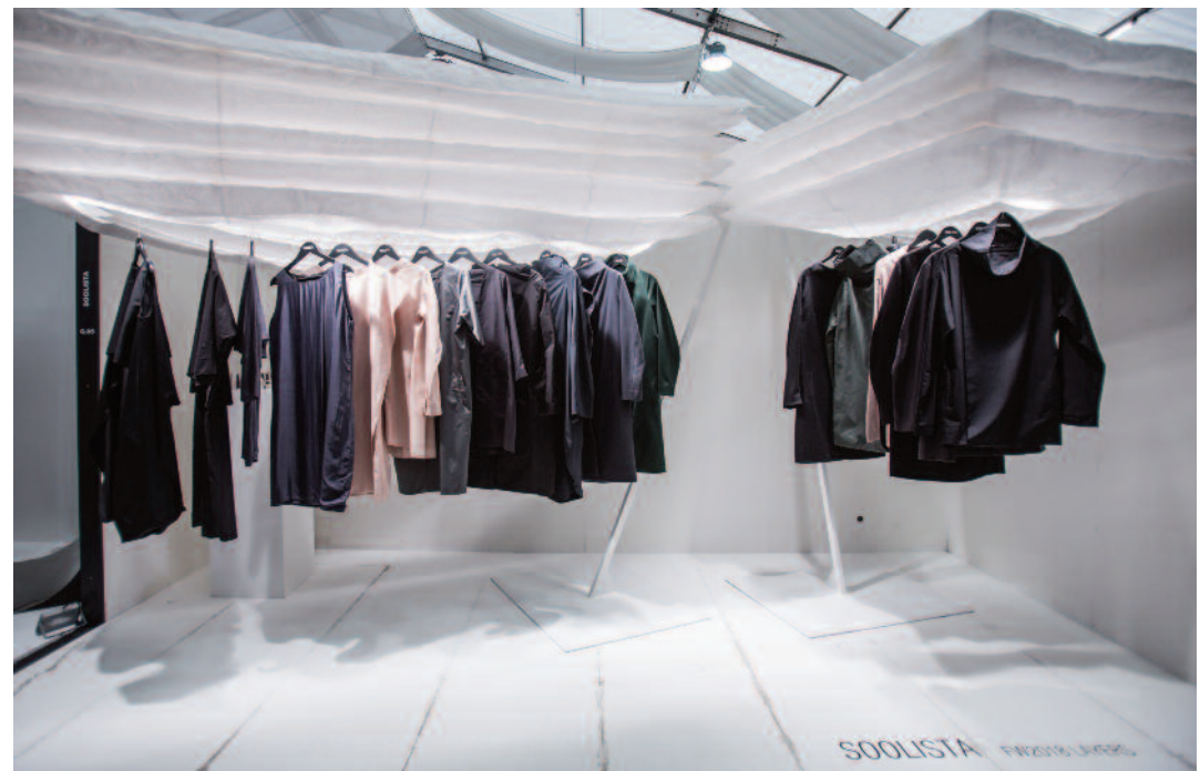
SOOLISTA, Designblok 2017