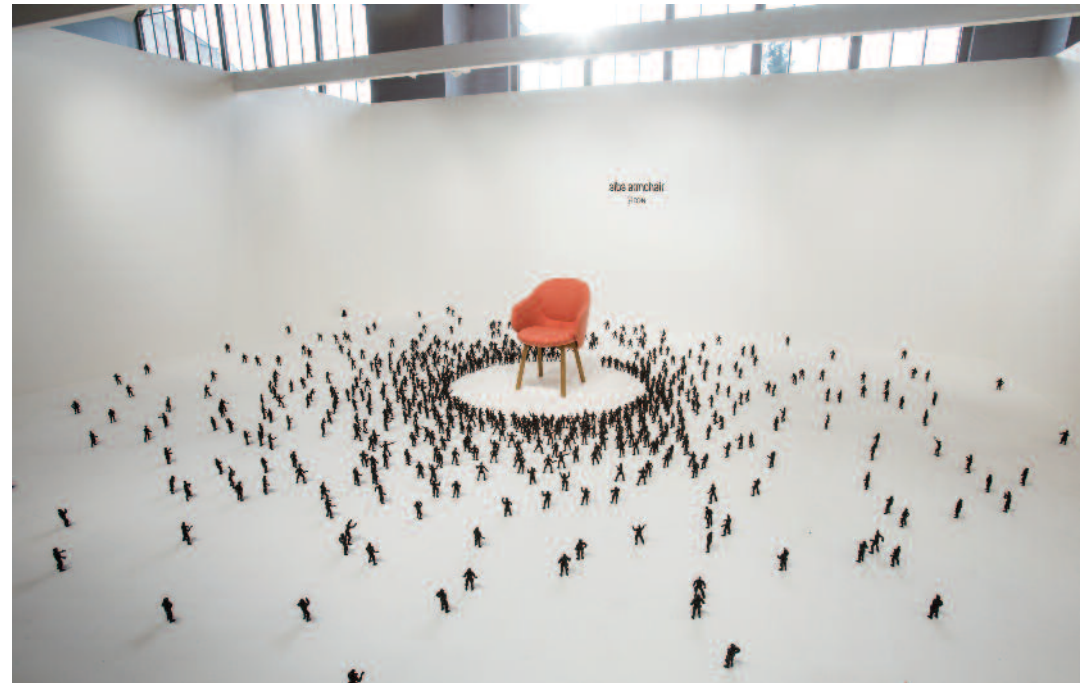
TON, Designblok 2017