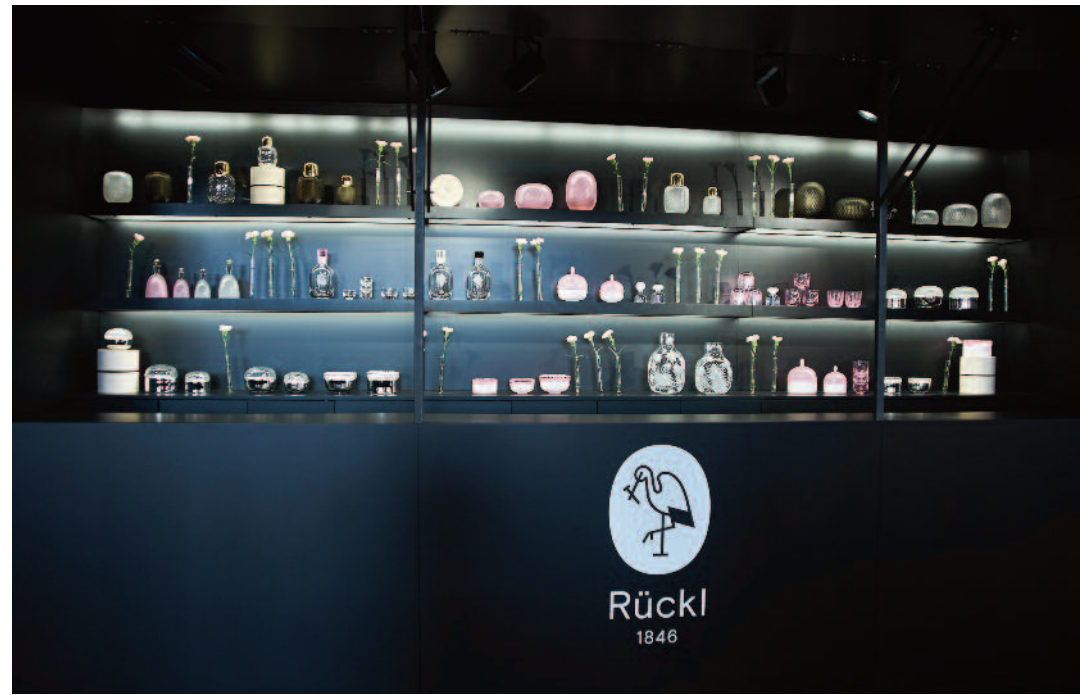
Rüchl, Designblok 2017