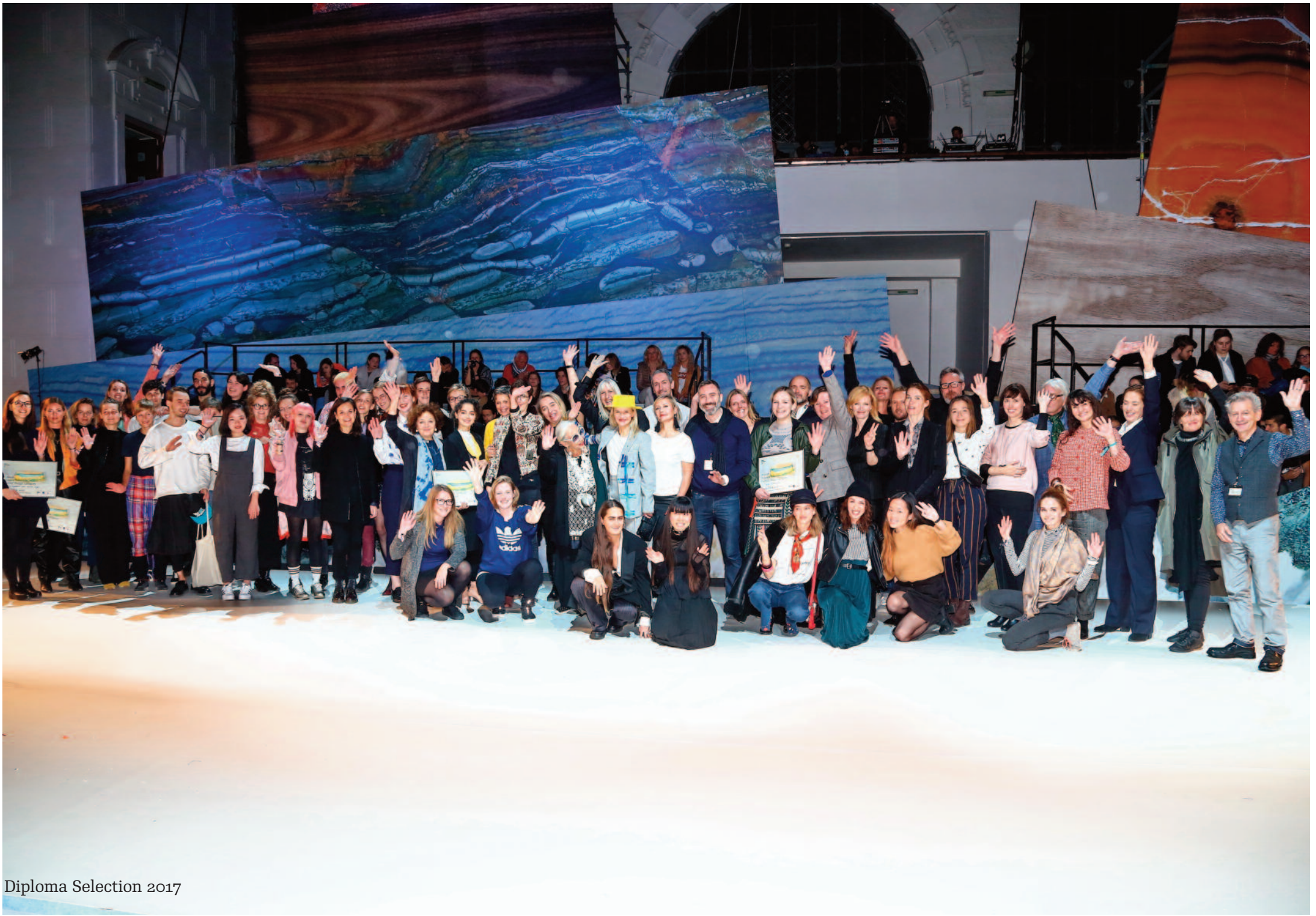
Diploma Selection 2017