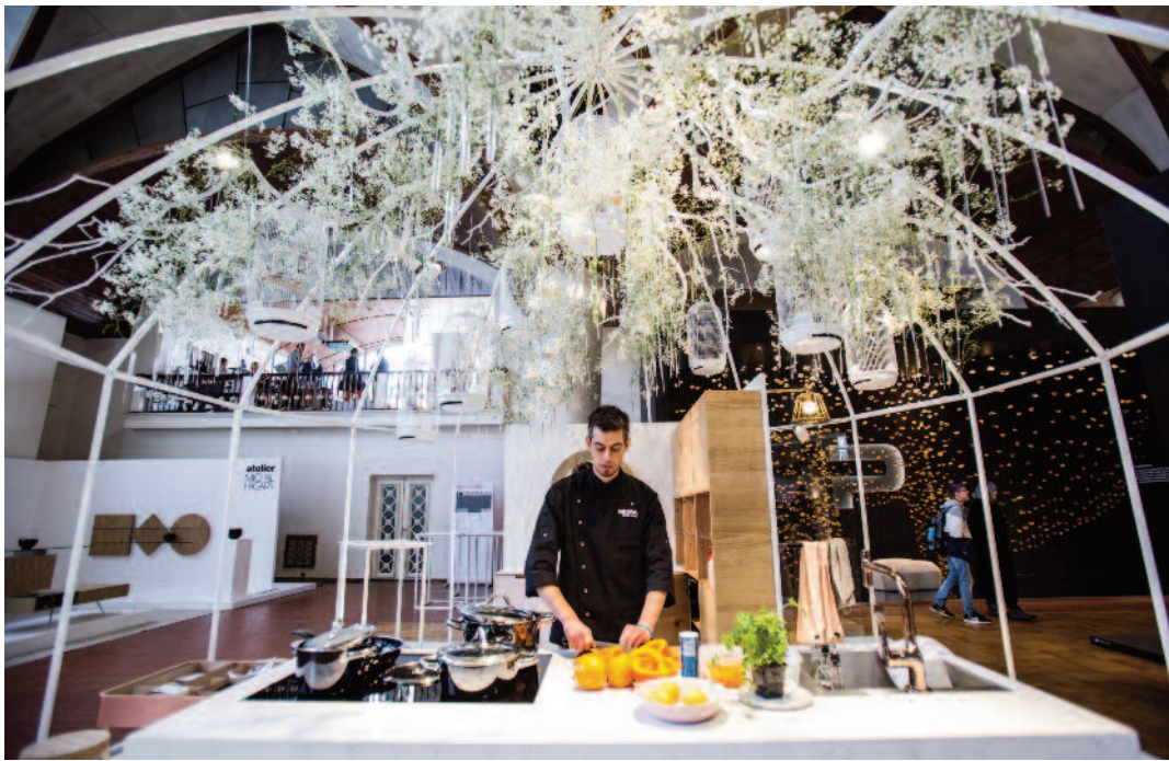
Hansgrohe and Lebon, Designblok 2017