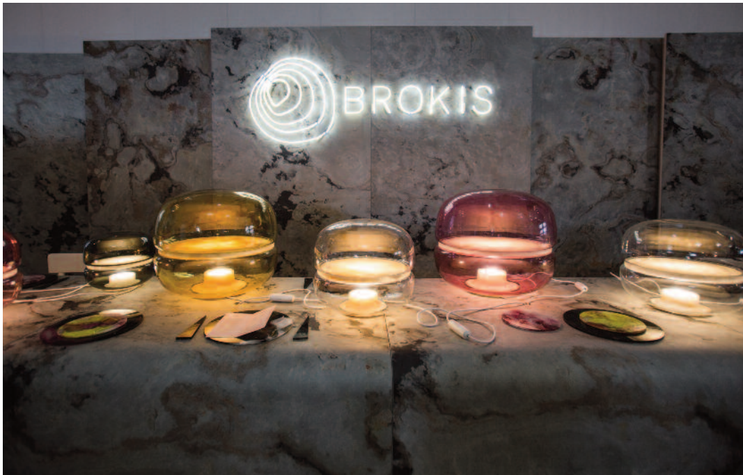
Brokis, Designblok 2017