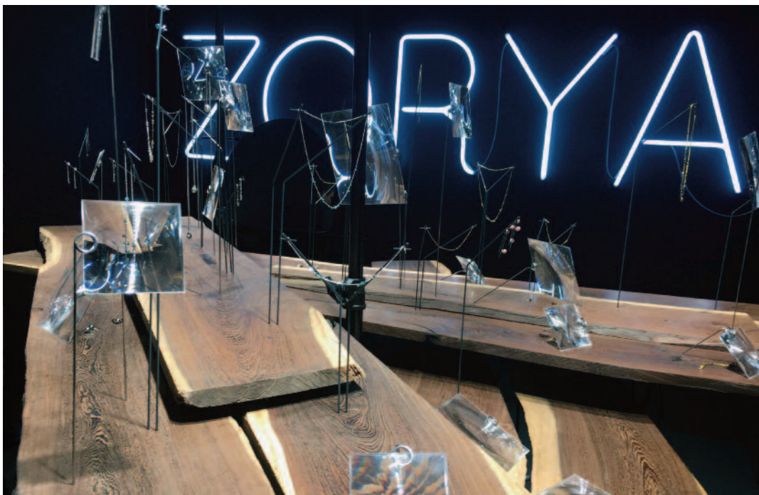
ZORYA, Designblok 2017