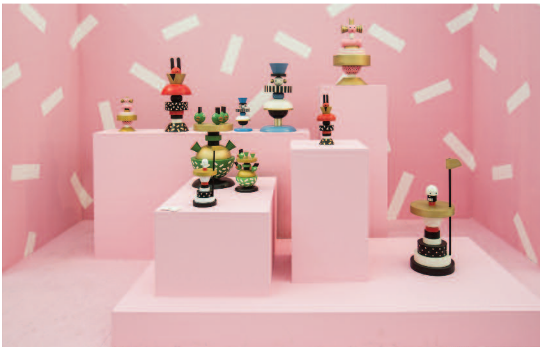
MY DVĚ, Designblok 2017