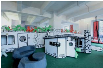
Magis by 3DH