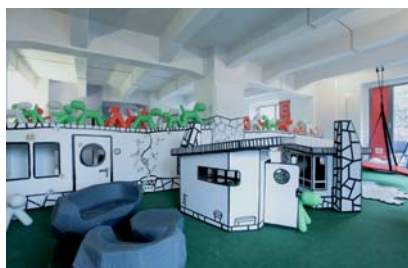
Magis by 3DH